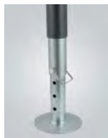
Adjustable Drop-Down Leg with 5-1/2" Foot Pad