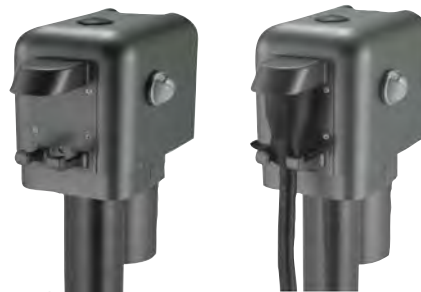
LED work lights are aimed rearward at the hookup brackets in addition to the coupler. Note the built-in connector storage bracket.