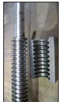
ACME Screw (some other brands)

The Brute features a ball screw which reduces friction compared to the ACME screw used on some other brands. The balls roll through the threads on the Brute's shaft and nut.