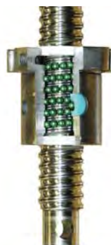
Ball Screw (The Brute)